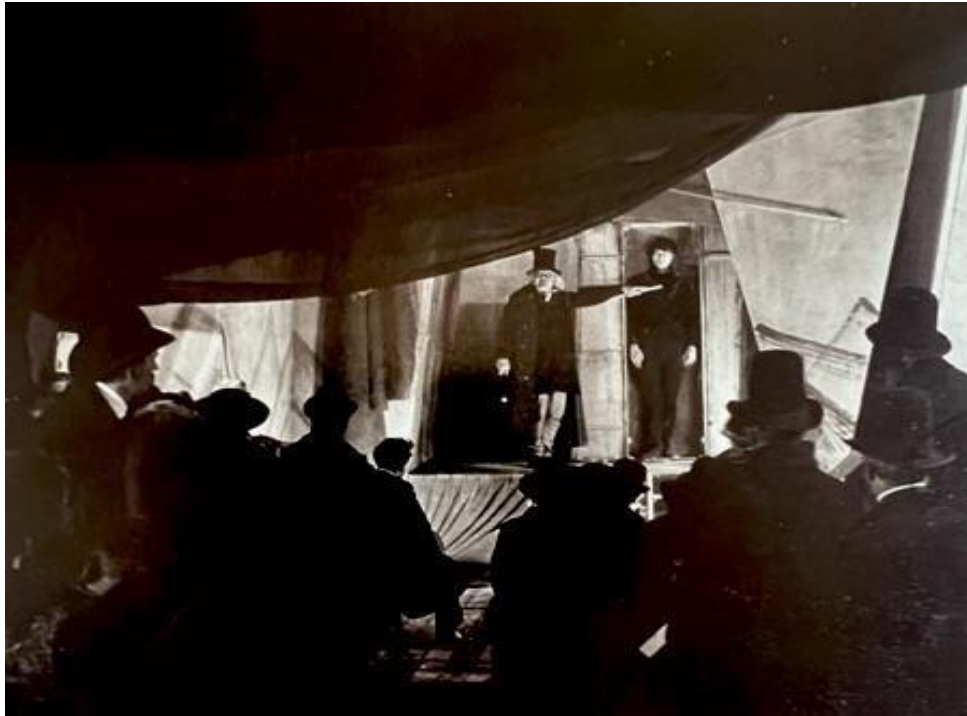
Dr. Caligari's Cabinet as a fairground booth and quasi-movie theater