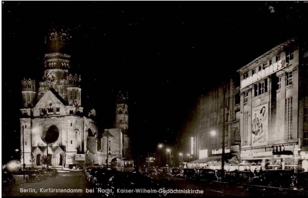
Caligari opened at the illustrious Marmorhaus Theater (on the right)